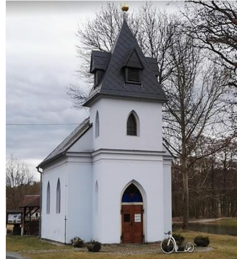
Doly I / 5B