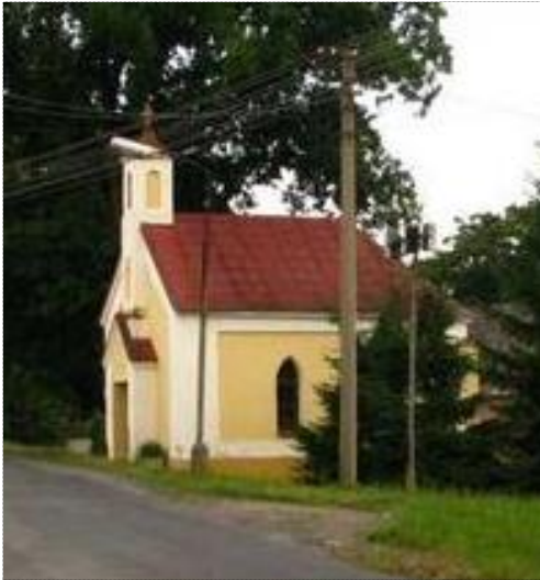
Oldřichov / 10B