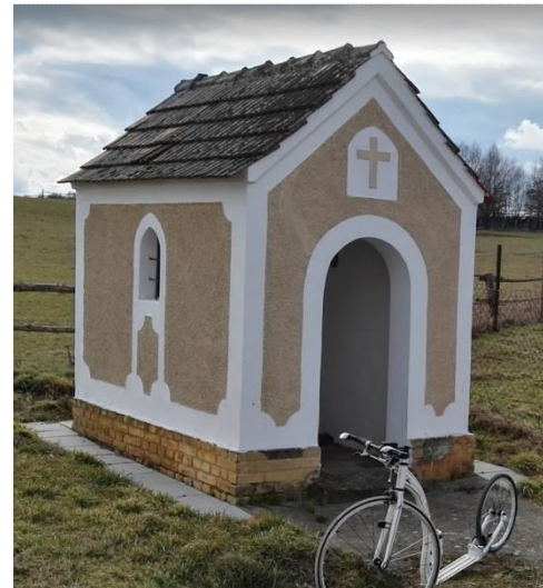
Lužná II / 10B