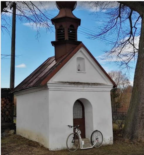
Malý Rapotín / 10B