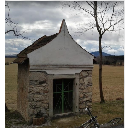
Doly II / 10B