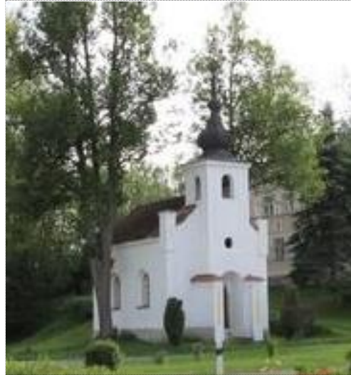
Klíčov / 20B